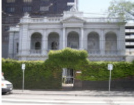
DODGSHUN HOUSE SOHE 2008