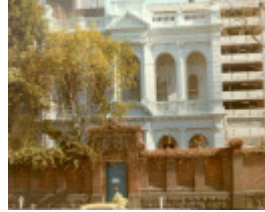
1 dodgshun house brunswick street fitzroy front view