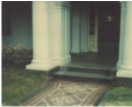
dodgshun house brunswick street fitzroy entrance