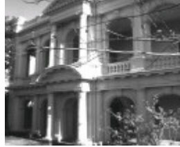
dodgshun house brunswick street fitzroy b&w front elevation