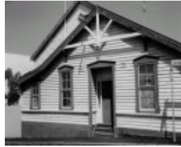
1 former richmond drill hall gipps street richmond front view