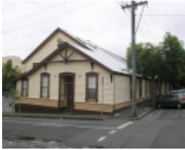
RICHMOND RIFLES VOLUNTEER ORDERLY ROOM SOHE 2008