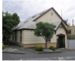
RICHMOND RIFLES VOLUNTEER ORDERLY ROOM SOHE 2008