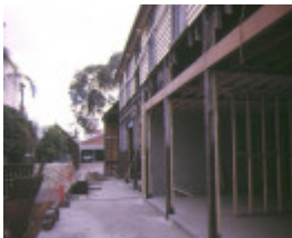
1 former richmond drill hall gipps street richmond rear view