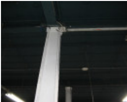
Dimmeys_Richmondinterior columns_9 July 08