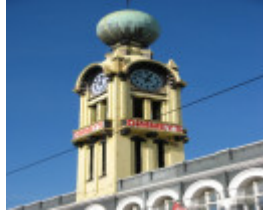
Dimmeys_Richmond_tower_K. July 08