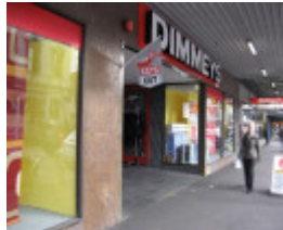
Dimmeys_Richmond_shop windows_9 July 08