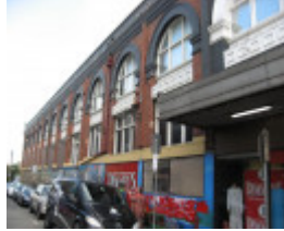
Dimmeys_Richmond_Green St elevation_9 July 08