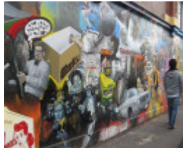
Dimmeys_Richmond_part of Green St mural_9 July 08