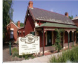
h00505 heritage express cottage h0505