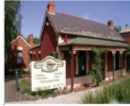
h00505 heritage express cottage h0505