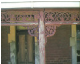
residence gisborne rd bacchus marsh detail of iron lace