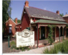
h00505 heritage express cottage h0505