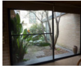
Fenner House interior 3 Sept 2016