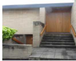
Fenner House detail of entrance Sept 2016