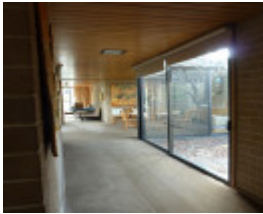
Fenner House interior 2 Sept 2016