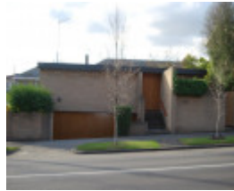
45041 Fenner House South Yarra Aug 08 7