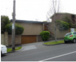
Fenner House exterior Sept 2016