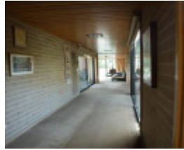
Fenner House interior 1 Sept 2016