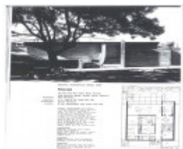
Architecture in Australia Oct 1967, p 826.jpg