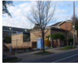
45041 Fenner House South Yarra Aug 08 4