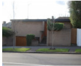
45041 Fenner House South Yarra Aug 08 2