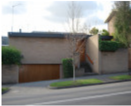
45041 Fenner House South Yarra Aug 08 3