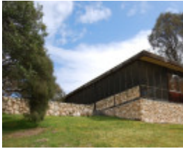
H2209 Grimwade House Rye Oct 08