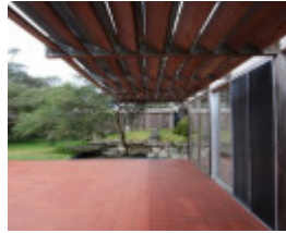
H2209 Grimwade House Rye Oct 08 6