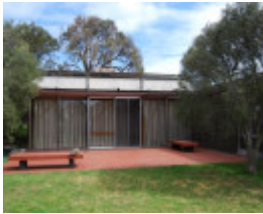
H2209 Grimwade House Rye Oct 08 7