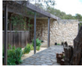
H2209 Grimwade House Rye Oct 08 1