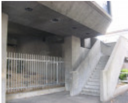
Plumbers & gasfitters