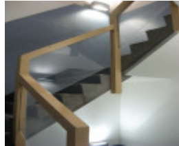
Plumbers & gasfitters stairwell