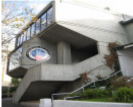
Plumbers & gasfitters