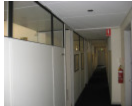
Plumbers & gasfitters second floor