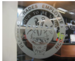
Plumbers & gasfitters etched glass doors on reception entrance