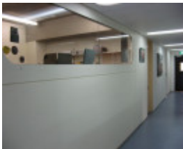
Plumbers & gasfitters ground floor corridor