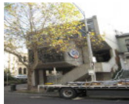
Plumbers & gasfitters