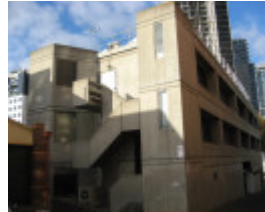
Plumbers & gasfitters