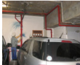
Plumbers & gasfitters garage