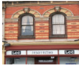
SHOPS SOHE 2008