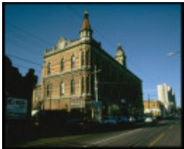
h00559 236 252 brunswick street