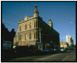
h00559 236 252 brunswick street