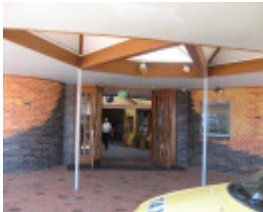
Church of St Michael & St John