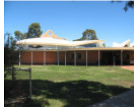
Church of St Michael & St John