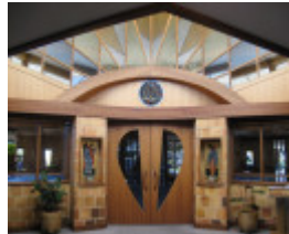
Church of St Michael & St John