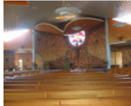
Church of St Michael & St John