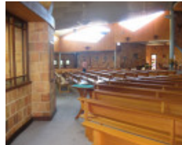
Church of St Michael & St John