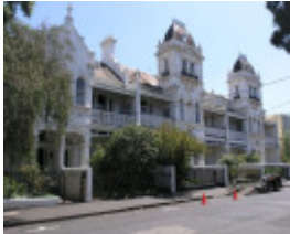
MARION TERRACE SOHE 2008