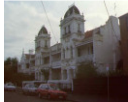
1 marion tce burnett st st kilda ac2 apr1999