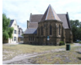
CHRIST CHURCH COMPLEX SOHE 2008