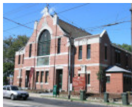
ALL SAINTS CHURCH, HALL AND FORMER VICARAGE SOHE 2008