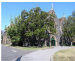
ALL SAINTS CHURCH, HALL AND FORMER VICARAGE SOHE 2008