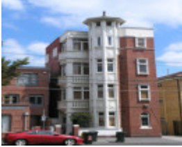
THE CANTERBURY SOHE 2008