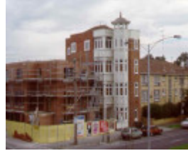
1 the canterbury 236 canterbury road st kilda front pm2 jul99