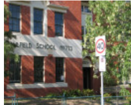
PRIMARY SCHOOL NO.773 SOHE 2008