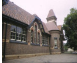
1 primary school 773 caulfield south window detail