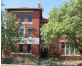
PRIMARY SCHOOL NO.773 SOHE 2008