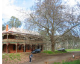
H0963 Gregory s Hotel