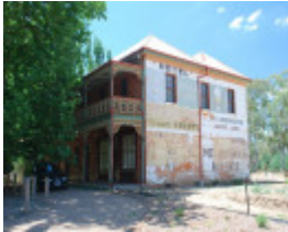
GREGORYS BRIDGE HOTEL SOHE 2008