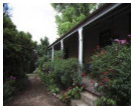
millbank grant street bacchus marsh verandah