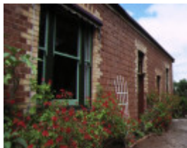
millbank grant street bacchus marsh side view windows and brickwork