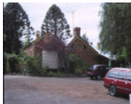
1 millbank grant street bacchus marsh rear view of homestead