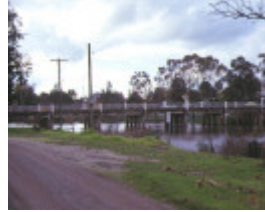
1 bridge broken river benalla side view 1989