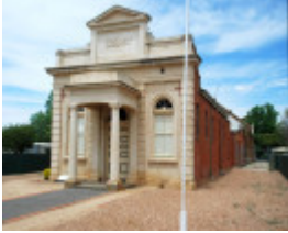
THE ATHENAEUM AND MEMORIAL HALL SOHE 2008