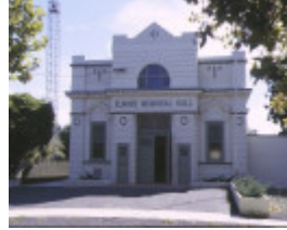
1 the athenaeum & memorial hall michie street elmore memorial front view apr1998