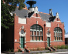
PRIMARY SCHOOL NO. 734 SOHE 2008