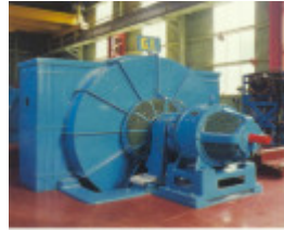
h01187 rubicon hydro electric scheme rubicon interior she project 2004