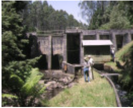
1 rubicon hydro electric scheme rubicon royston dam jan1994