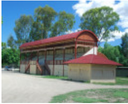
GRANDSTAND SOHE 2008