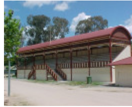
1 grandstand benalla front view nov99