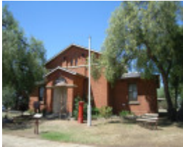
FORMER PLEASANT CREEK COURT HOUSE SOHE 2008