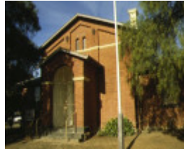
1 flormer pleasant creek court house longfield street stawell front view