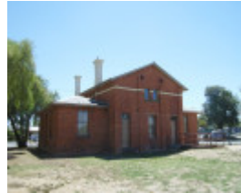
FORMER PLEASANT CREEK COURT HOUSE SOHE 2008