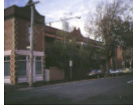
1 dorothy terrace 34 lulie street abbotsford front detail