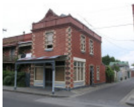
DOROTHY TERRACE SOHE 2008