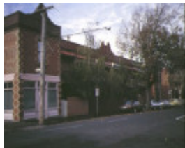
1 dorothy terrace 34 lulie street abbotsford front detail