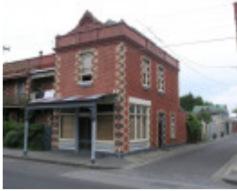
DOROTHY TERRACE SOHE 2008