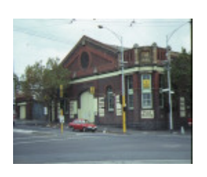
former cable tramway engine house abbotsford street north melbourne front view