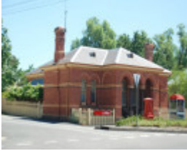
CHEWTON POST OFFICE SOHE 2008