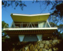
1 atunga terrace, elevation