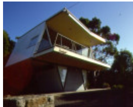
McCraith House Atunga