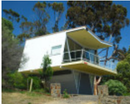
MCCRAITH HOUSE SOHE 2008