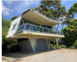
Butterfly House Jan 2023