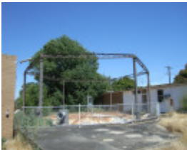
HAMILTON GAS HOLDER SOHE 2008