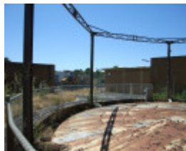
HAMILTON GAS HOLDER SOHE 2008