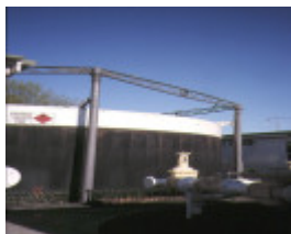
1 hamilton gas holder craig street hamilton gas holder