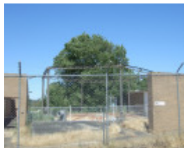
HAMILTON GAS HOLDER SOHE 2008