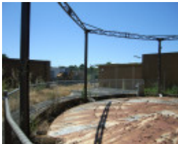
HAMILTON GAS HOLDER SOHE 2008