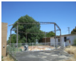
HAMILTON GAS HOLDER SOHE 2008