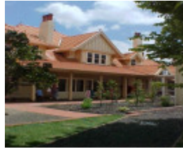
H01178 myrniong back2 feb2003