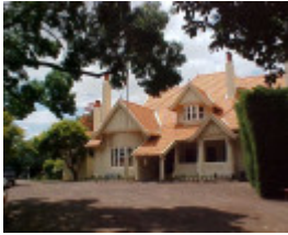
H01178 1 myrniong front feb2003