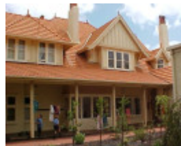
H01178 myrniong back feb2003