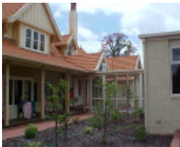
H01178 myrniong feb2003