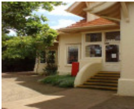
H01178 myrniong side2 feb2003