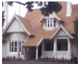
h01178 myrniong cnr kent and macarthur st hamilton front view lshe project 2003