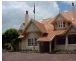
H01178 myrniong front2 feb2003