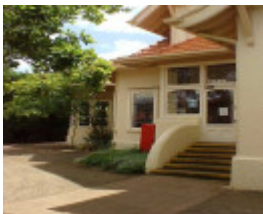
H01178 myrniong side2 feb2003