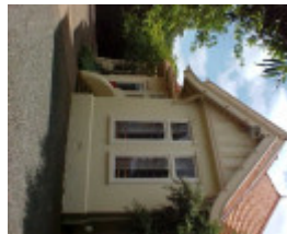
H01178 myrniong side feb2003