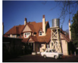
H01178 myrniong hensley park road hamilton front view aug1994