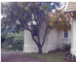
h01178 myrniong cnr kent and macarthur st hamilton rear roof line she project 2003