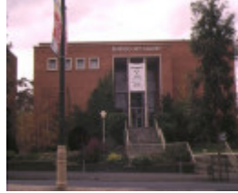
1 bendigo art gallery view street bendigo front entrance