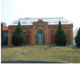
BENDIGO ART GALLERY SOHE 2008