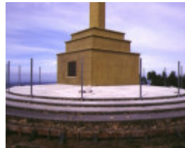
h01027 cameron memorial cross cameron drive mount macedon cross base