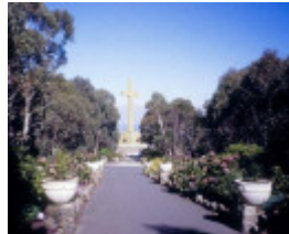
h01027 macedon cross cameron drive mt macedon cross she project 2003