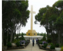
MACEDON CROSS SOHE 2008