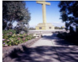
h01027 1 macedon cross cameron drive mt macedon approach she project 2003