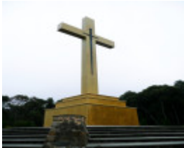
MACEDON CROSS SOHE 2008