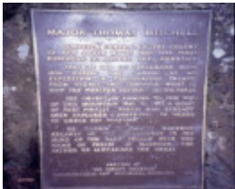
h01027 macedon cross cameron drive mt macedon plaque she project 2003