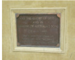
MACEDON CROSS SOHE 2008