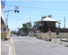
INTERLOCKING RAILWAY CROSSING GATES SOHE 2008