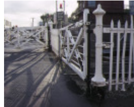
1 interlocked railway crossing gates anderson street yarraville closed interlocked gates apr1994