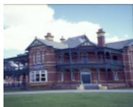
bundoor homestead snake gully drive bundoor exterior she project 2003