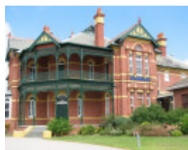
BUNDOORA PARK HOMESTEAD SOHE 2008