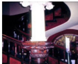
bundoora homestead snake gully drive bundoor staircase she project 2003