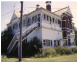
J V Smith Homestead Bundoora Side View January 1995