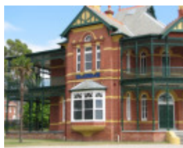
BUNDOORA PARK HOMESTEAD SOHE 2008