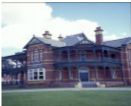
bundoora homestead snake gully drive bundoor exterior she project 2003