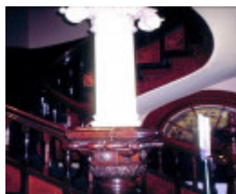
bundoor homestead snake gully drive bundoor staircase she project 2003