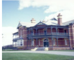
h01091 1 bundoor homestead snake gully drive bundoora close up homestead she project 2003