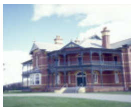
h01091 1 bundoor homestead snake gully drive bundoor close up homestead she project 2003