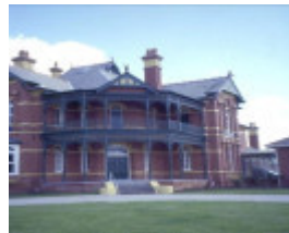
bundoora homestead snake gully drive bundoor facade she project 2003