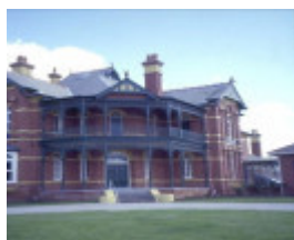
bundoor homestead snake gully drive bundoor facade she project 2003