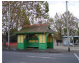
Tram Shelter Dandenong Rd Caulfield May 2006 South Side