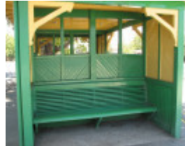
TRAM SHELTER SOHE 2008