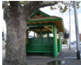
Tram Shelter Dandenong Rd Caulfield May 2006 West Side