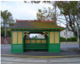
Tram Shelter Dandenong Rd Caulfield May 2006 North Side