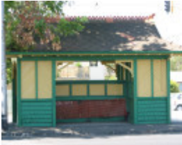
TRAM SHELTER SOHE 2008