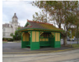
H0230 Tram shelter Dandenong Rd Caulfield May 2006 north east pj