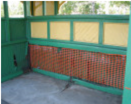
TRAM SHELTER SOHE 2008