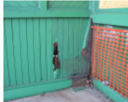
TRAM SHELTER SOHE 2008