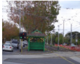
H0230 Tram shelter Dandenong Rd Caulfield May 2006 side view pj