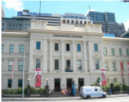
FORMER CUSTOMS HOUSE SOHE 2008