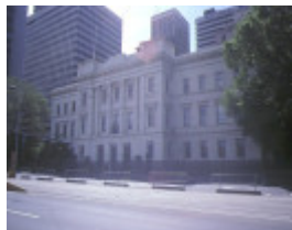
1 former customs house 400 flinders street melbourne front view nov1984