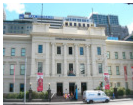
FORMER CUSTOMS HOUSE SOHE 2008