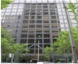
FORMER BHP HOUSE SOHE 2008