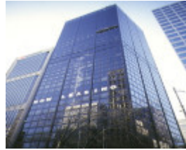
1 fmr bhp house william street melb front elevation