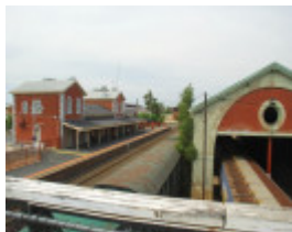
ECHUCA RAILWAY STATION COMPLEX SOHE 2008