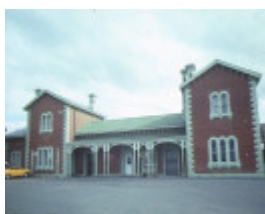
1 echuca railway station complex front entrance jul1984