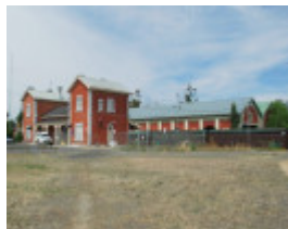
ECHUCA RAILWAY STATION COMPLEX SOHE 2008