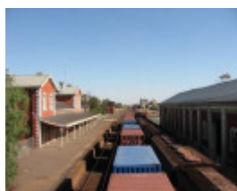
Echuca RWS Complex from North February 2002.