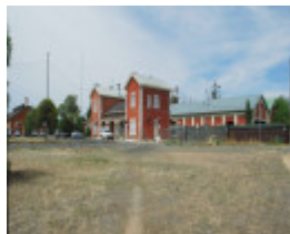
ECHUCA RAILWAY STATION COMPLEX SOHE 2008