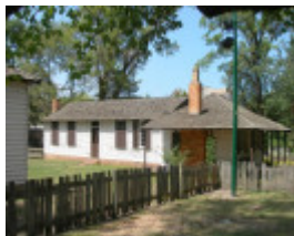
LA TROBE'S COTTAGE SOHE 2008