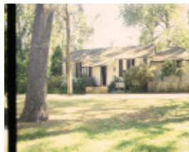
1 la trobe cottage 162 birdwood avenue south yarra front view