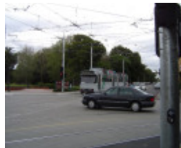
Grand Union Junction Caulfield April 2006