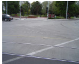
Grand Union Junction Caulfield Rails April 2006