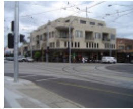
4732 Grand Union Junction Caulfield 2644