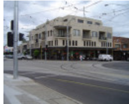
4732 Grand Union Junction Caulfield 2644