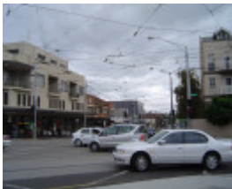
Grand Union Junction Caulfield overhead wires April 2006