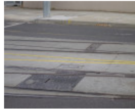
Grand Union Junction Caulfield Rails April 2006