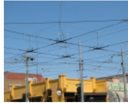
GRAND UNION TRAMWAY JUNCTION SOHE 2008