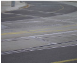
Grand Union Junction Caulfield Rails April 2006