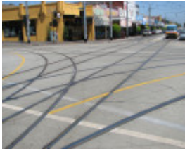
GRAND UNION TRAMWAY JUNCTION SOHE 2008