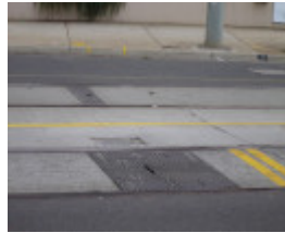
Grand Union Junction Caulfield Rails April 2006