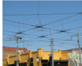
GRAND UNION TRAMWAY JUNCTION SOHE 2008