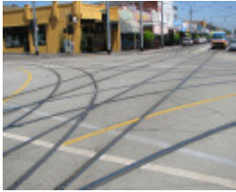
GRAND UNION TRAMWAY JUNCTION SOHE 2008