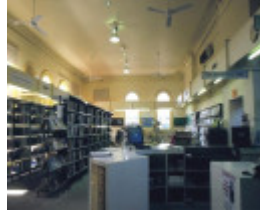
east gippsland regional library service street bairnsdale interior she project 2003