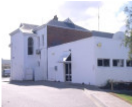
east gippsland regional library service street bairnsdale new extension at rear she project 2003