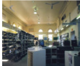
east gippsland regional library service street bairnsdale interior she project 2003