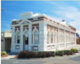
EAST GIPPSLAND SHIRE LIBRARY (FORMER BAIRNSDALE MECHANICS INSTITUTE) SOHE 2008