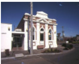
h01284 bairnsdale mechanics institute front view