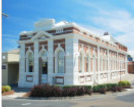
EAST GIPPSLAND SHIRE LIBRARY (FORMER BAIRNSDALE MECHANICS INSTITUTE) SOHE 2008