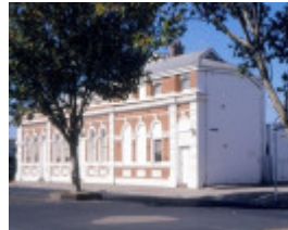
east gippsland regional library service street bairnsdale nicholson st side and rear she project 2003