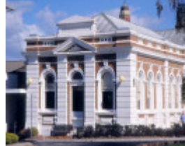
h01284 1 east gippsland regional library service street bairnsdale main entrance she project 2003