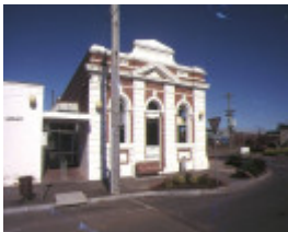
h01284 bairnsdale mechanics institute front view