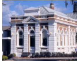
h01284 1 east gippsland regional library service street bairnsdale main entrance she project 2003