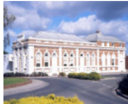
east gippsland regional library service street bairnsdale nicholson st side she project 2003