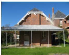
Bairnsdale Hospital rear of north wing