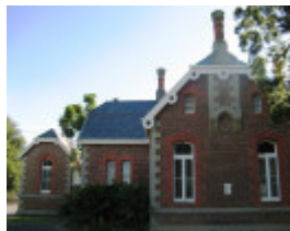
Bairnsdale Hospital south wing & contagious diseases ward