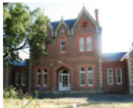
Bairnsdale Hospital central block and built-in connecting sections