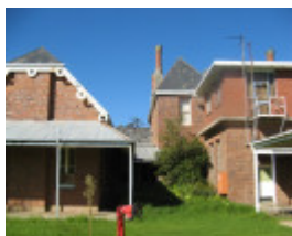
Bairnsdale Hospital rear of north and central wings showing later additions