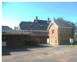
Bairnsdale Hospital view from south of contagious diseases and south wing rear