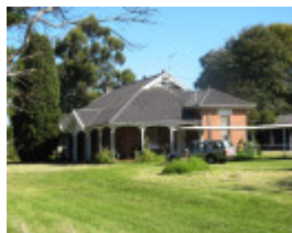
Bairnsdale Hospital nurses' home