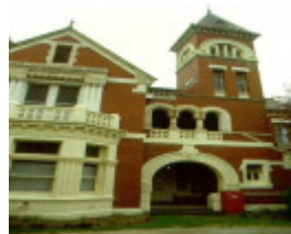
1 cestia h1924 2000