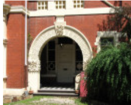
CESTRIA SOHE 2008