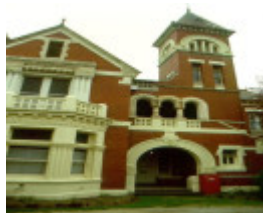
1 cestria h1924 2000