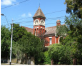
CESTRIA SOHE 2008