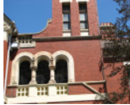
CESTRIA SOHE 2008