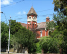
CESTRIA SOHE 2008