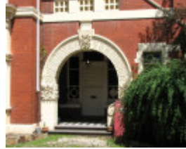
CESTRIA SOHE 2008