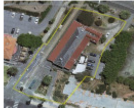
H0983 air photo 21-11- 2017.JPG