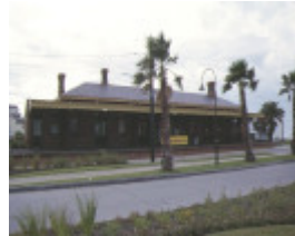
1 railway station complex beach road port melbourne front elevation mar1999