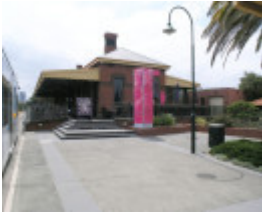
PORT MELBOURNE RAILWAY STATION SOHE 2008