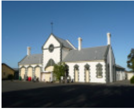
OSBORNE HOUSE SOHE 2008