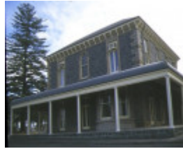
1 osborne house geelong front view of house apr1997