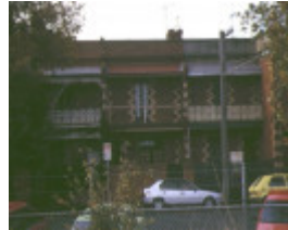
1 dorothy terrace 36 lulie street abbotsford front view