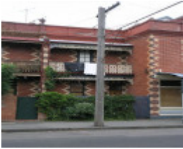
DOROTHY TERRACE SOHE 2008