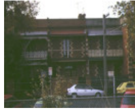
1 dorothy terrace 36 lulie street abbotsford front view