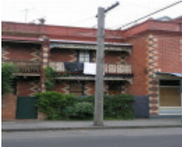
DOROTHY TERRACE SOHE 2008