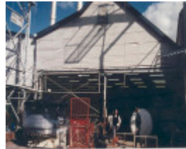
h01099 1 mildara blass distillery merbein