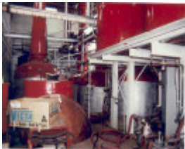
h01099 mildara blass distillery merbein copper pot stills