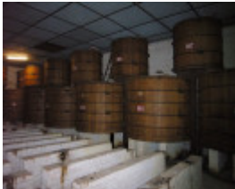
MILDARA BLASS DISTILLERY SOHE 2008