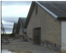
h01099 mildara blass distillery wentworth road merbein entrance to storage area may1983