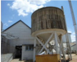
MILDARA BLASS DISTILLERY SOHE 2008