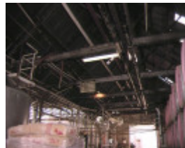
h01099 mildara blass distillery wentworth road merbein interior storage apr1995