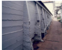
h01099 mildara blass distillery merbein wall of brandy store