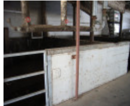
MILDARA BLASS DISTILLERY SOHE 2008