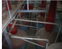
MILDARA BLASS DISTILLERY SOHE 2008