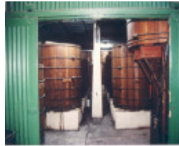
h01099 mildara blass distillery merbein brandy store