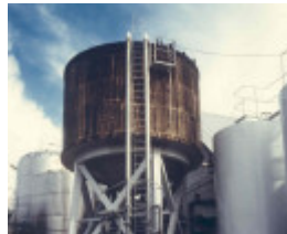
h01099 mildara blass distillery merbein water tank