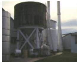
h01099 mildara blass distillery wentworth road merbein tank jun1995