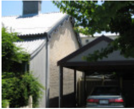
IRON COTTAGE SOHE 2008