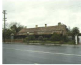
1 iron cottage brunswick road brunswick housing row 1992