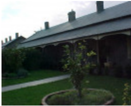
Iron Cottage 181 Brunswick Road Brunswick