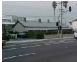
Iron Cottage 181 Brunswick Road Brunswick