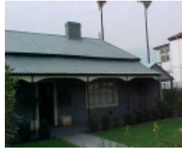
Iron Cottage 181 Brunswick Road Brunswick