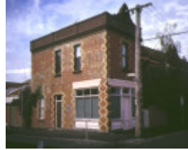
1 dorothy terrace 48 lulie street abbotsford rear-view