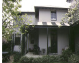
1 milton house aphrasia street geelong verandah