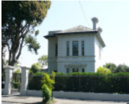
MILTON HOUSE SOHE 2008