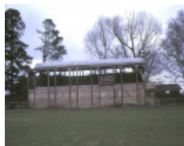
1 kingston grandstand kingston allendale road kingston front view jul1987