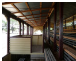
KINGSTON GRANDSTAND SOHE 2008