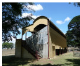
KINGSTON GRANDSTAND SOHE 2008