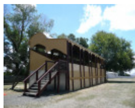
KINGSTON GRANDSTAND SOHE 2008