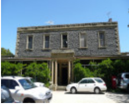
MORONGO PRIVATE BOARDING SCHOOL SOHE 2008