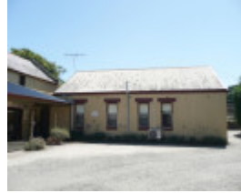
MORONGO PRIVATE BOARDING SCHOOL SOHE 2008