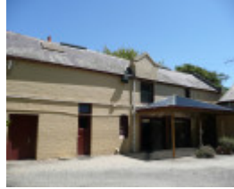
MORONGO PRIVATE BOARDING SCHOOL SOHE 2008