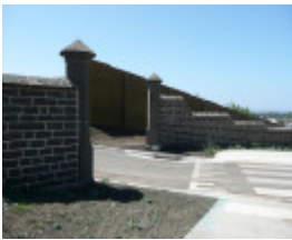
MORONGO PRIVATE BOARDING SCHOOL SOHE 2008