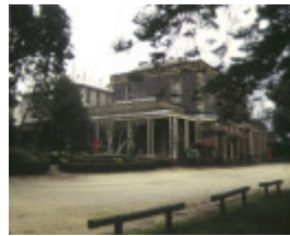
1 morongo bell post hill additions to south side of house